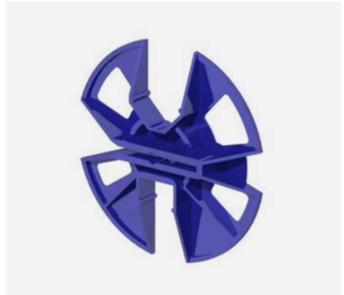
ACS Multi-Purpose Insulation Retaining Clip

The Two Part Tie allows a separate inner section to be built into the block or internal leaf, leaving a short slotted connection exposed for the connection of the outer sections, which are installed during the construction of the outer leaf. The standard inner sections are available in two standard lengths, either 170mm or 220mm in length to suit a maximum insulation board thickness of 70mm or 120mm consecutively (alternative lengths are available upon request). The Two Part Tie requires an embedment of 62.5mm into the bed joint in both leaves. The outer sections are available in a range of lengths to suit cavities from 150 - 400mm.